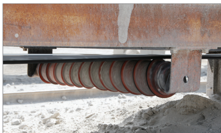
Fig 8.1 Spiral Urathon Return Roll